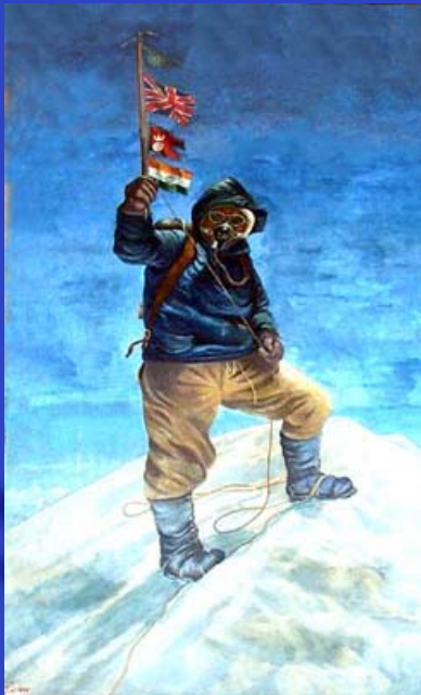
Tenzing Norgay atop Mt. Everest